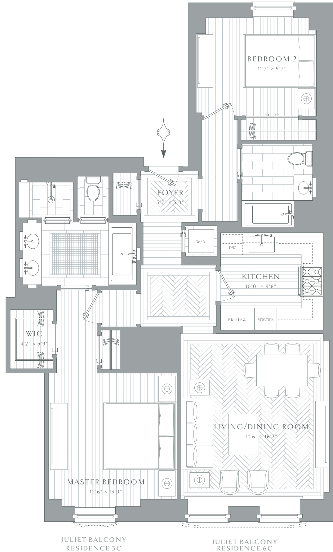
JULIET BALCONY RESIDENCE 3C