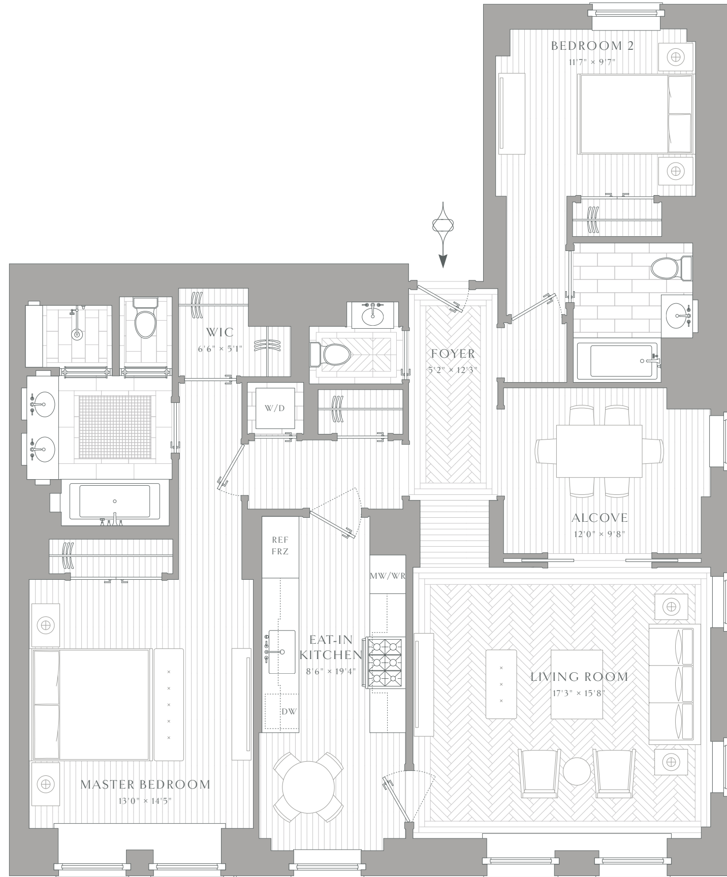
JULIET BALCONY RESIDENCE 14B

The complete offering terms are in an offering plan available from Sponsor. Sponsor: 1562/1564 Second Realty LLC, 419 Lafayette Street, 5th floor, New York, New York 10003. File no. CD18-0150. All dimensions are approximate and subject to normal construction variances and tolerances. Square footage exceeds the usable floor area. Sponsor reserves the right to make changes in accordance with the terms of the offering plan. Plans and dimensions may contain minor variations from floor to floor. Equal housing opportunity.