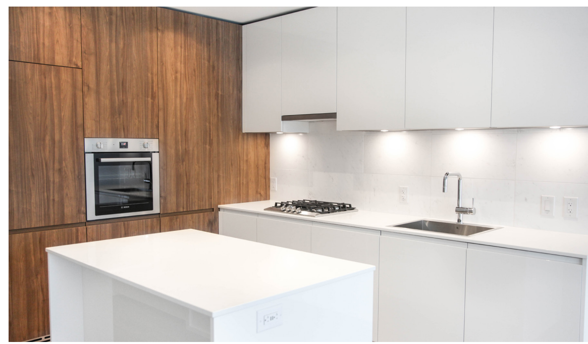
PROGRESS OF SUITES ON LEVEL 5 (FEBRUARY 2020)