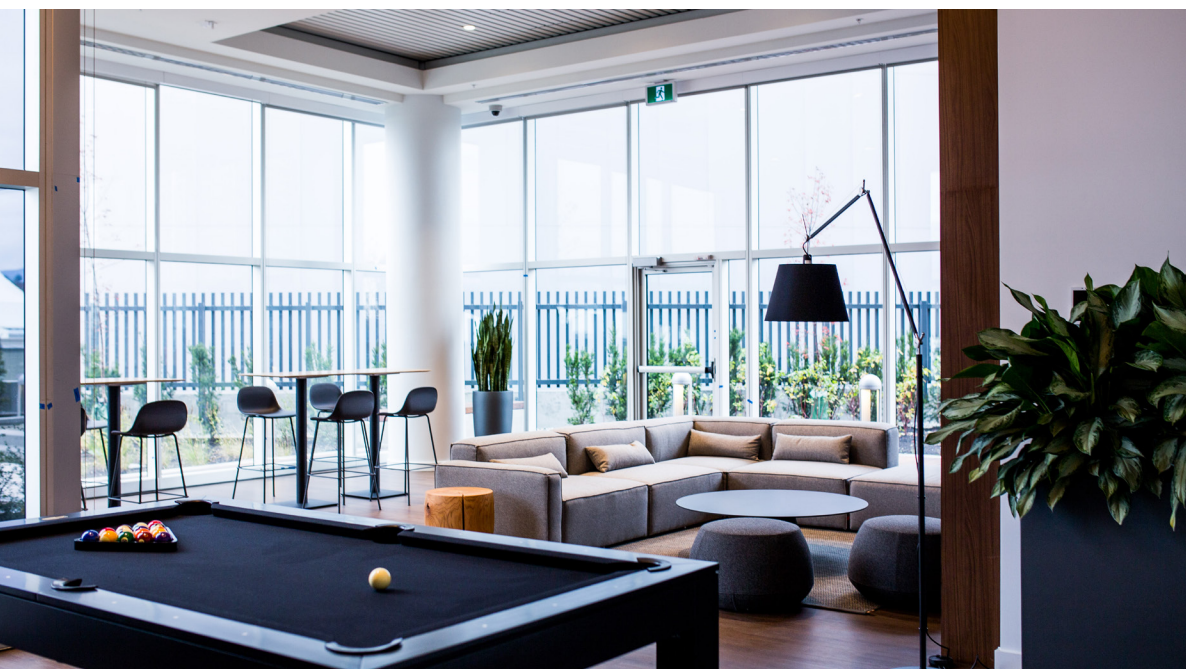
AMENITY ROOM AT TOWER ONE (NOVEMBER 2019)