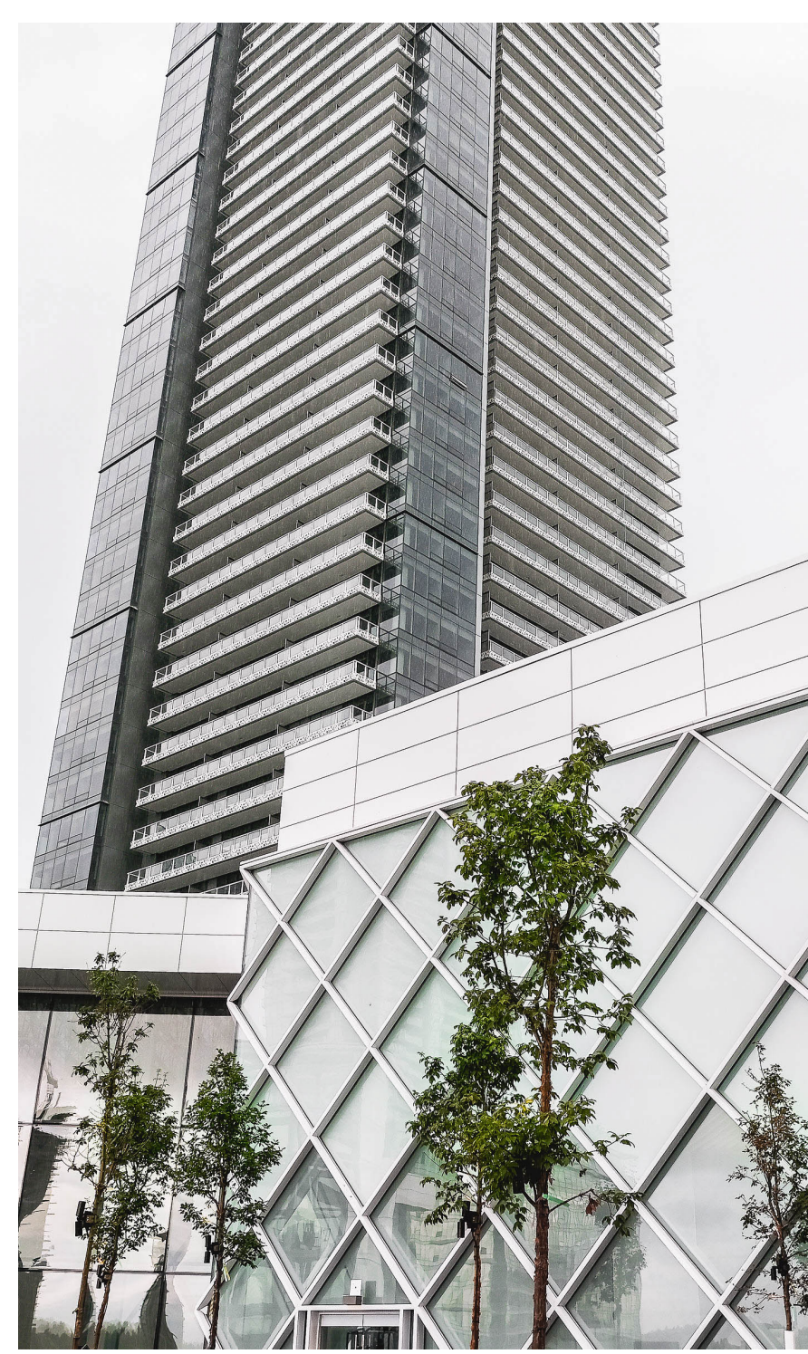
TOWER ONE AT THE AMAZING BRENTWOOD (NOVEMBER 2019)